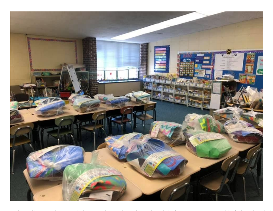
Becky Harkin's second grade BES classroom after packing up her students desks for the year. Teachers and Staff cleaned out desks and lockers for parents to pick up outside on assigned days and times.